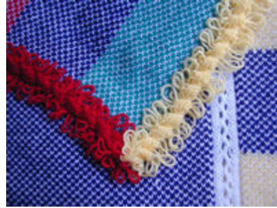
With Fringe Trim

Yarn: 3-Ply by Tamm or comparable yarn 8 - 10 oz white (MC) 3 - 4 oz red (CC) 3 - 4 oz yellow (CC) 3 - 4 oz green (CC) 3 - 4 oz blue (CC)